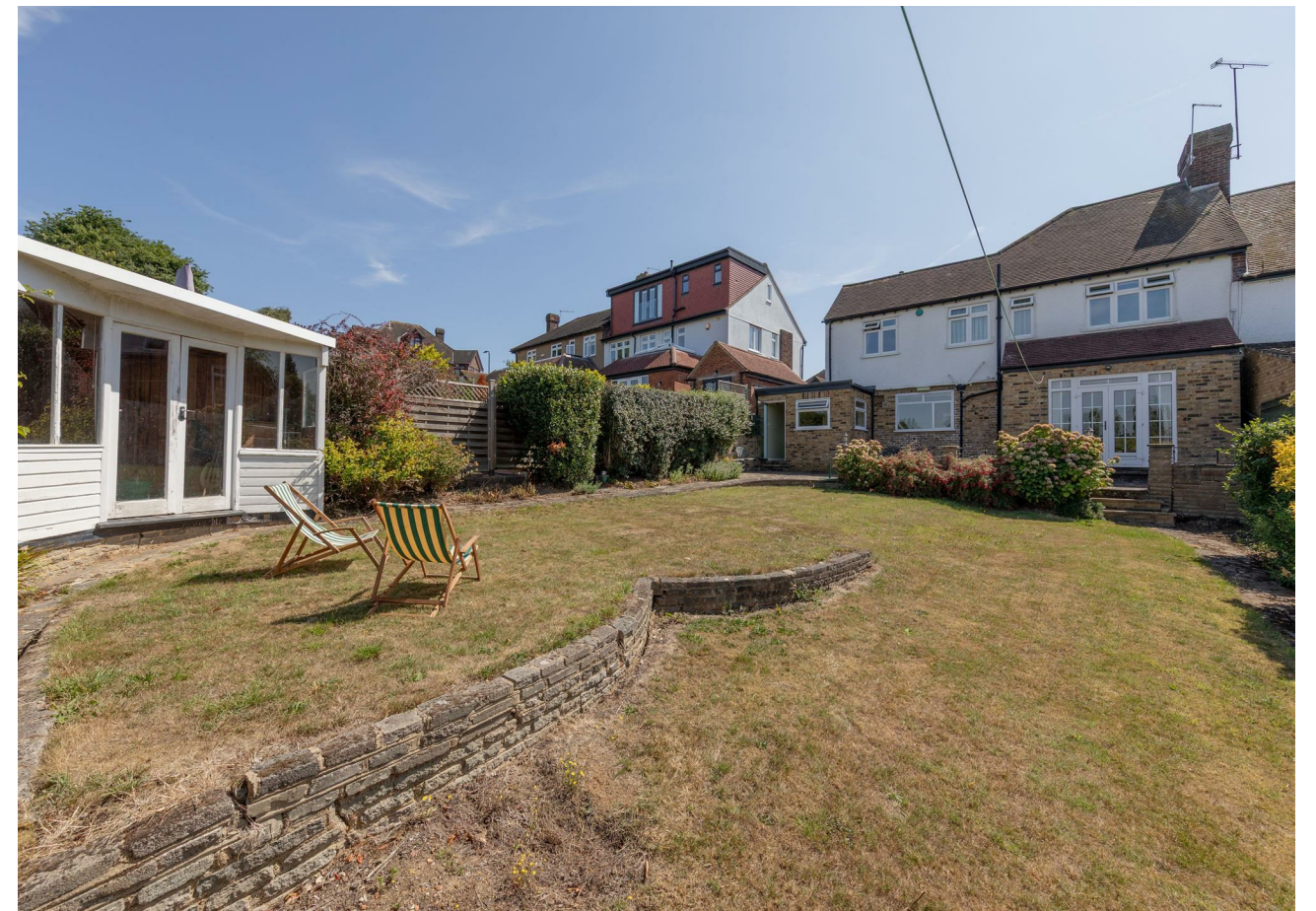
Summer House 12'11" x 7'9"